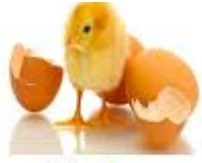
Are Eggs Alive?

Our topic this half term is called ‘Are Eggs Alive?’ We will be looking at life cycles of a range of animals that come from eggs, animals and their young and traditional tales with animal characters. We will also be learning about how plants grow and discussing the season of Spring.