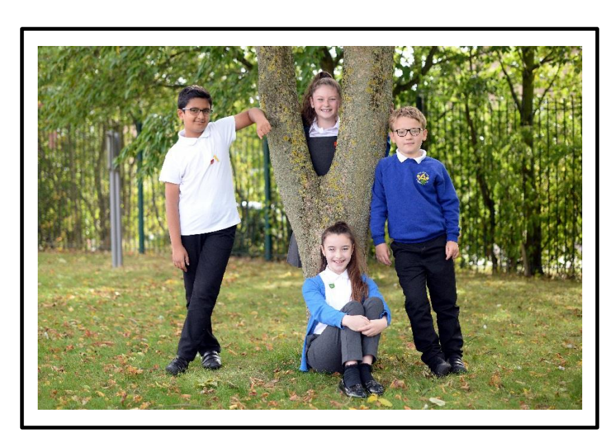
Head boy and girl and their deputies